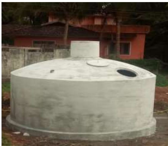
TABLE 6: RECHARGING PITS