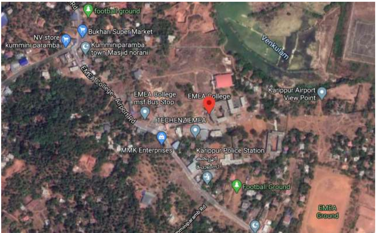
FIGURE 1: COLLEGE CAMPUS – SATELLITE VIEW